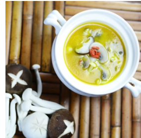
Mushroom Soup 蘑菇浓汤