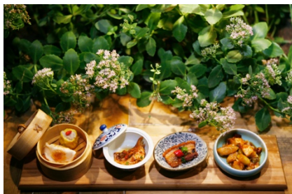
The Jingshan Quartet 红墙四重奏